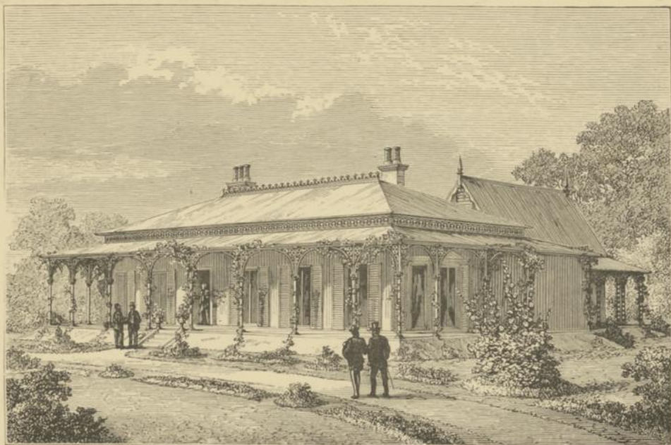
OFFICES OF THE ROYAL BRITISH COMMISSION, WITH EXHIBITORS' READING ROOM IN THE REAR.