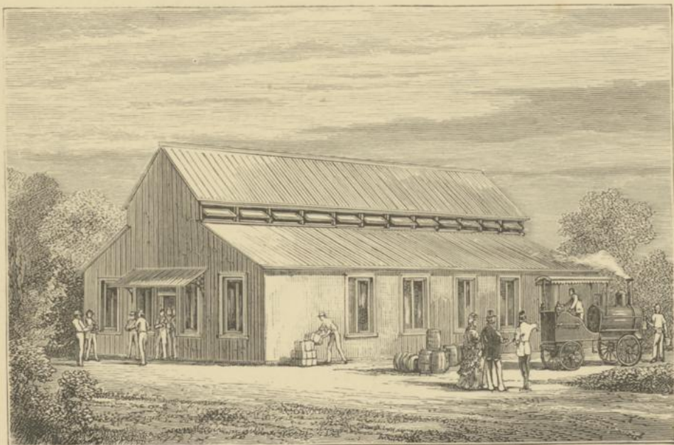
BRITISH WORKMEN'S HOUSES.